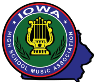
Iowa High School Music Association