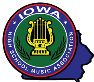
Iowa High School Music Association